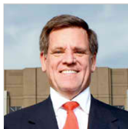
ROCKY WIRTZ Owner of the Chicago Blackhawks